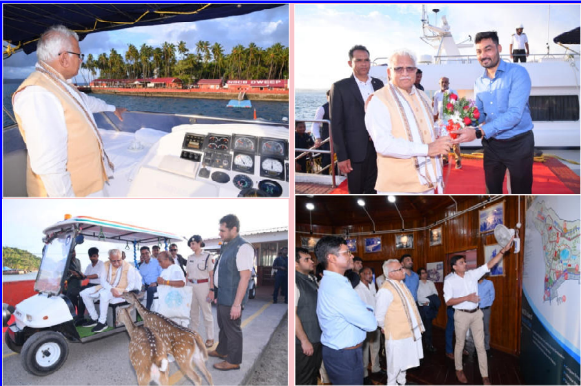
Hon'ble Union Minister of Power and Housing & Urban Affairs visits Netaji Subhash Chandra Bose Island