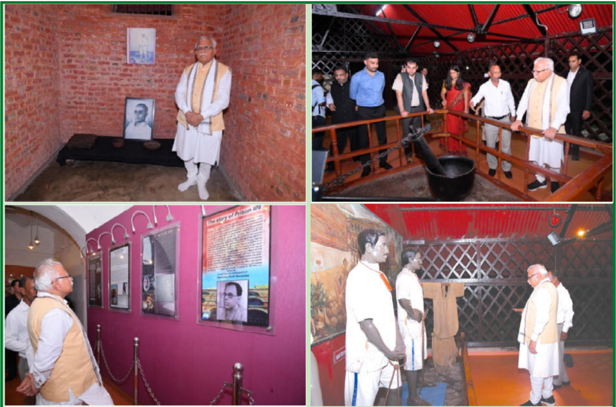
Hon'ble Union Minister of Power and Housing & Urban Affairs visits National Memorial Cellular Jail